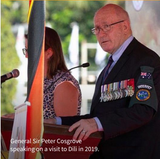
General Sir Peter Cosgrove speaking on a visit to Dili in 2019.

04 Continued to prioritise education by partnering with the Ministry of Education, Youth and Sport to implement the new phase of our ALMA program in Manatuto and Liquica. This included providing electronic tablets to school leaders to improve communication and access to curriculum materials, together with training - all designed to help improve the quality of teaching.